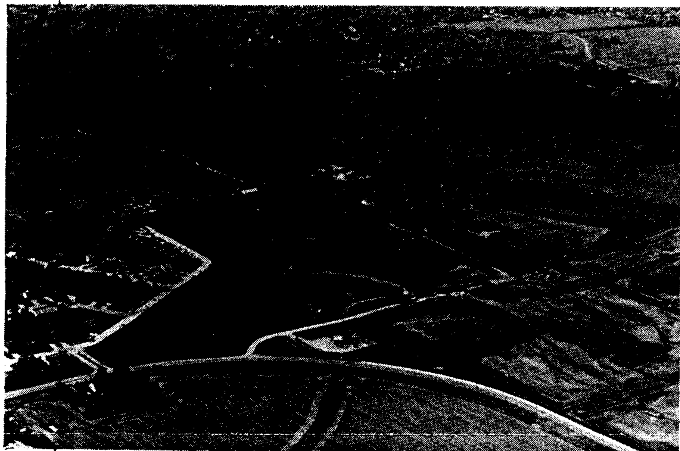
#1 Southview - Shows Southeast section

On October 13, 1989, two aerial photographs of this area were taken by Gary Moore. Northridge was in its infancy, then, and the only streets were Northridge Parkway and Ridgetop Road. Not a single house had yet been built. Gary Moore is offering these two photographs to Northridge residents at a special, one time only, price. Prints must be ordered by July 21, 1997.